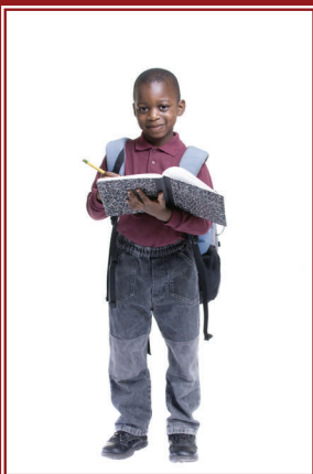
NCLB focuses on the importance of educating our children.